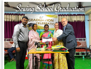
Sewing School Graduation