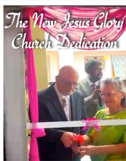
The New Jesus Glory Church Dedication