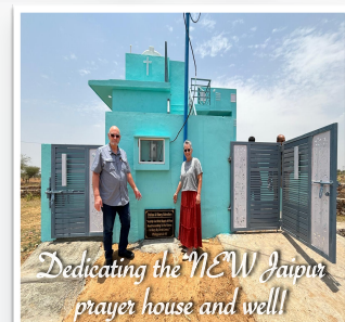
Dedicating the NEW Jaipur prayer house and well!