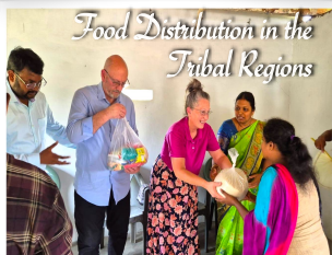
Food Distribution in the Tribal Regions