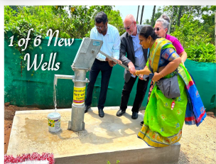
1 of 6 New Wells