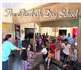
The Elizabeth Day School