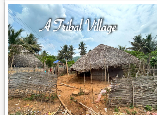
A Tribal Village