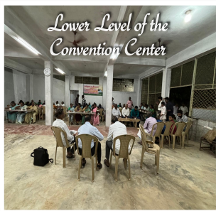
Lower Level of the Convention Center