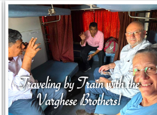
Traveling by Train with the Varghese Brothers!