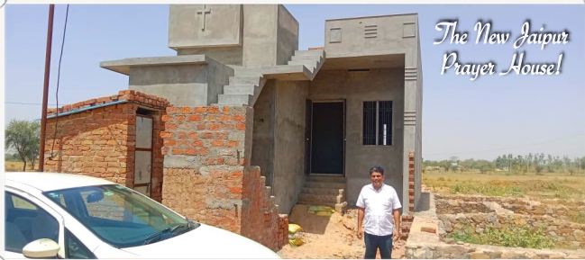
The New Jaipur Prayer House!