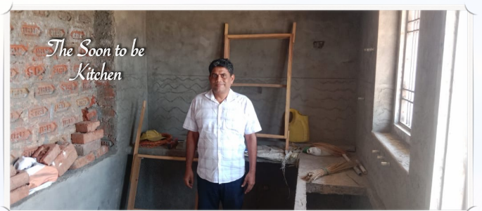
The Soon to be Kitchen

We praise God for the hardworking men, women, and the donors who were such a vital part of making this long awaited prayer house a reality. Countless hours of energy and prayer went into this project and we are thankful for their diligent efforts!