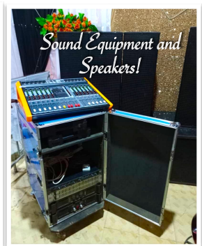
Sound Equipment and Speakers!