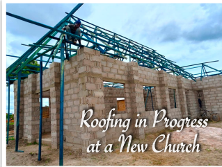
Roofing in Progress at a New Church