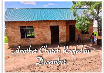
Another Church Roofed in December

Two NEW CHURCHES had their roofs installed in December and will soon be ready for believers to gather together under them!