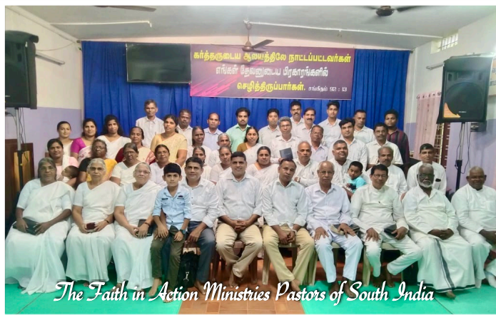
The Faith in Action Ministries Pastors of South India