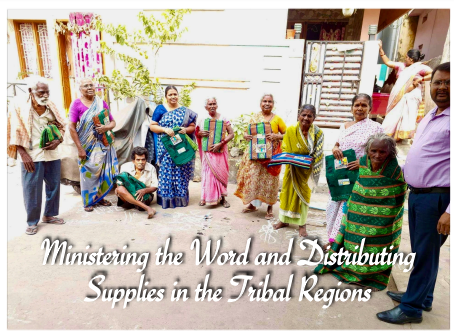
Ministering the Word and Distributing Supplies in the Tribal Regions