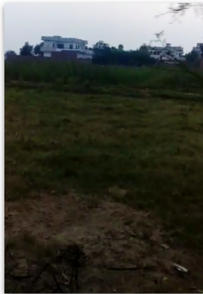
The parcel of land he hopes to purchase for a well and church.