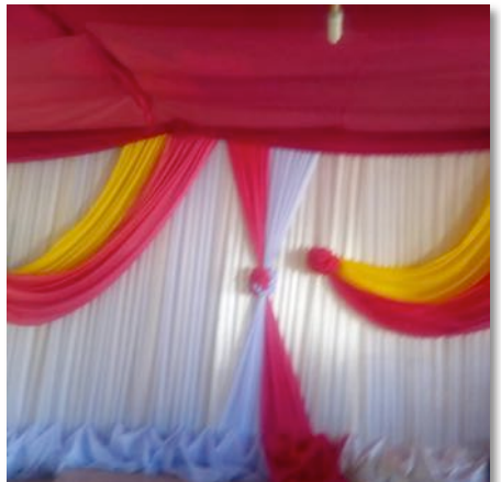
Decorations hung up.