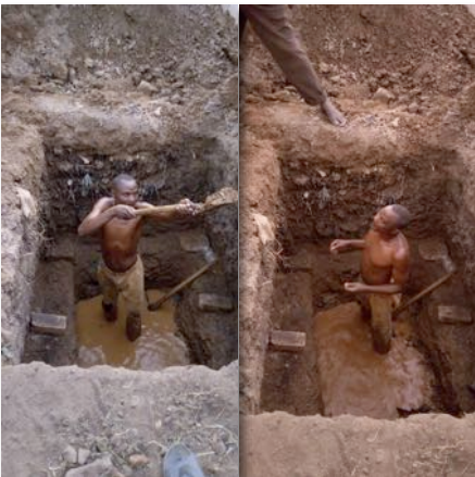
Digging hole for septic system.