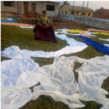
Washed conference decorations.