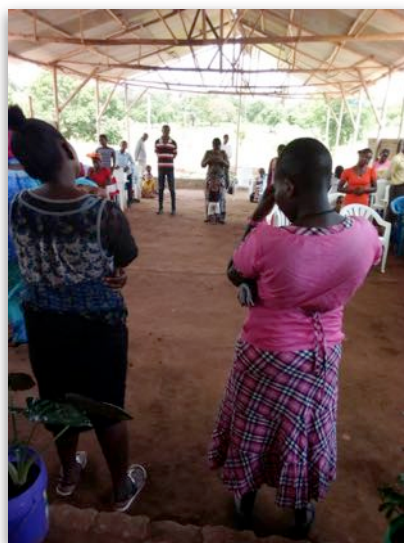
New Harvest Church at Dar es Salaam.

Pastor Laban will be traveling for almost three weeks this month. The first few days will include an ordination service for a new pastor for the New Harvest Church at Dar es Salaam. The remaining time will be spent visiting six churches in the area.