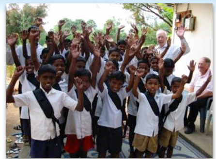
With orphan boys in India, 2007.