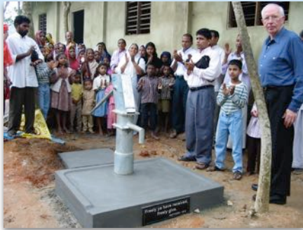
Well Dedication Ceremony in India, 2006.