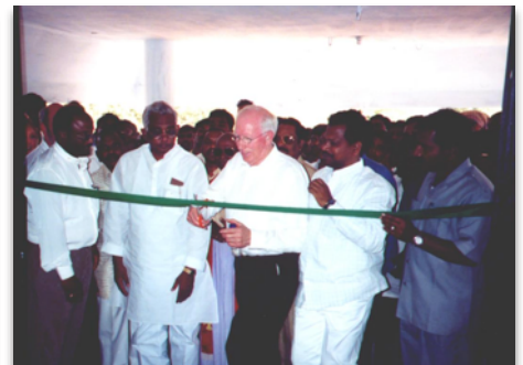
New church dedication in India, 2003.