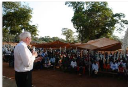
Open-air meeting in Tanzania, 2011.