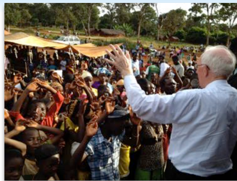
Open-air meeting in Tanzania, 2012.