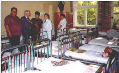
Visiting orphanage in Russia, 2002.