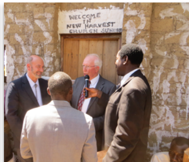
New church dedication in Tanzania, 2012.