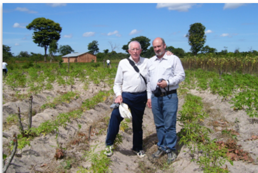
Visiting NH agricultural project in Katumba, Tanzania, 2009.