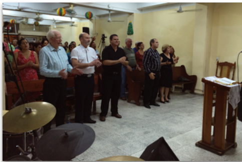
Visiting churches in Cuba, 2014.