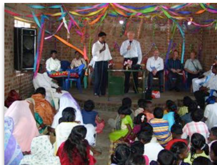
Preaching the Word in India, 2009.