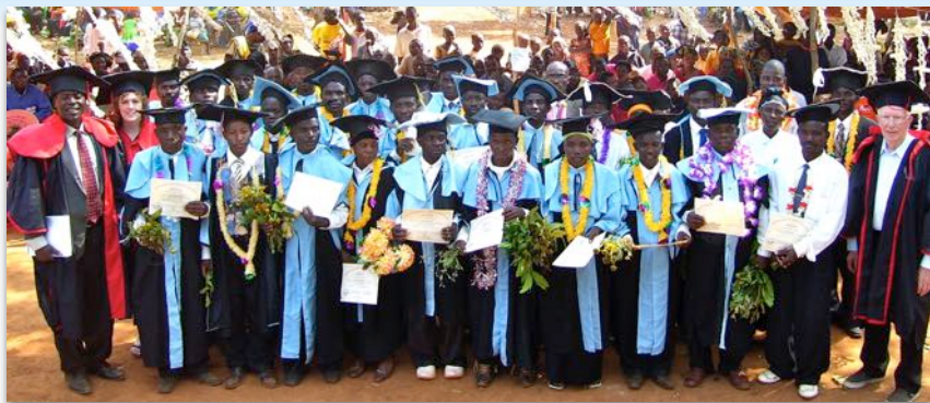
With Bible college graduates in Tanzania, 2011.