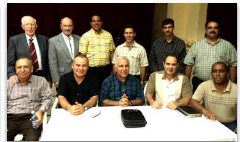
Encouraging pastors in Cuba, 2014.