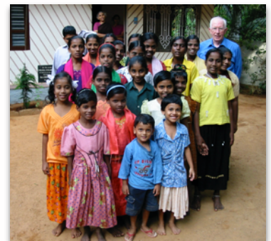
At girls' orphanage in India, 2007.