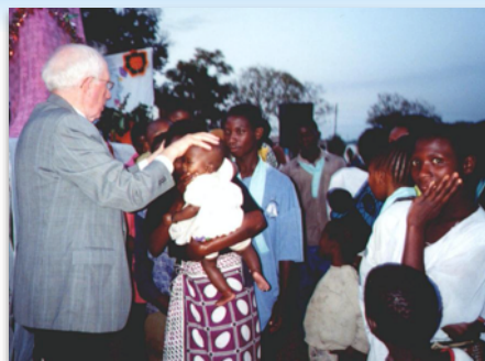
Praying over child in Zambia, 2002.