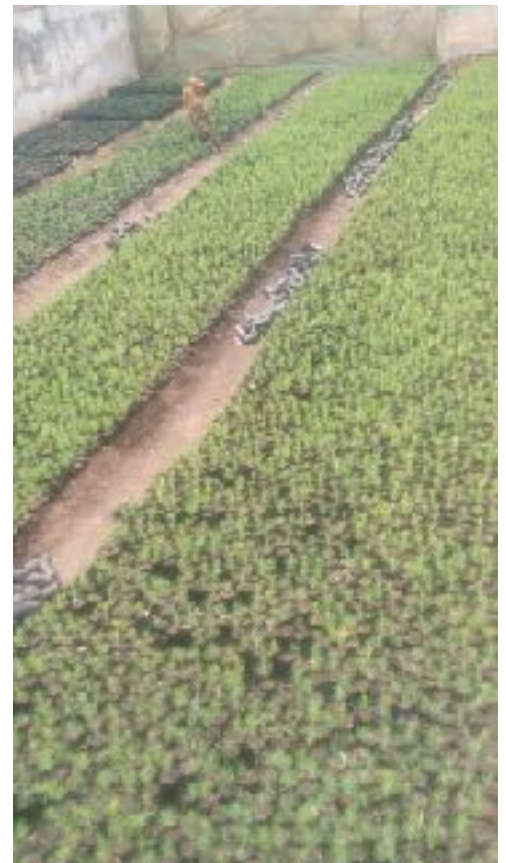
Tree seedbeds in August.

Your support allows Pastor Laban to purchase and plant trees to harvest for timber. The trees that they recently planted are growing quickly. Pastor Laban provided the picture on the right to show the progress. Profits will support the ministry of NHMI Tanzania, which includes church planting and pastoring, open-air evangelistic meetings, and seven (7) New Harvest Bible College branches.