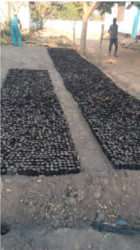
Tree seedbeds in June.