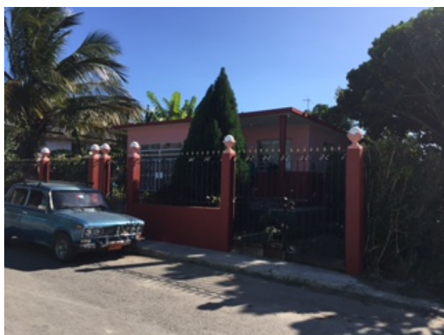
Pictured to the left: The home offered by the family in their congregation.