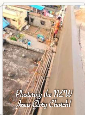
Plastering the NEW Jesus Glory Church!