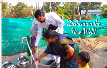
Dedication the New Well!