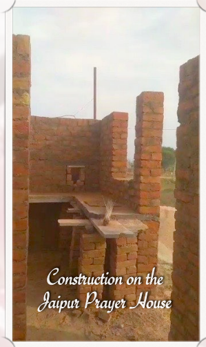
Construction on the Jaipur Prayer House