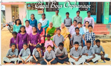
Gilgal Boys Orphanage