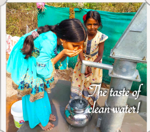
The taste of clean water!