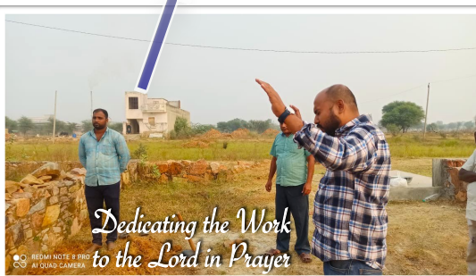
Dedicating the Work to the Lord in Prayer