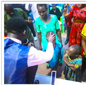
Walking Unassisted After Prayer for Healing!