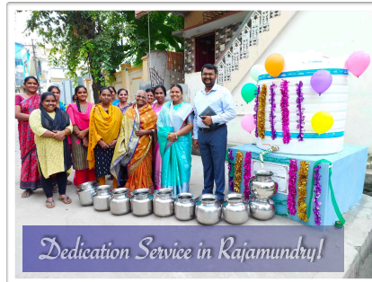
Dedication Service in Rajahmundry!