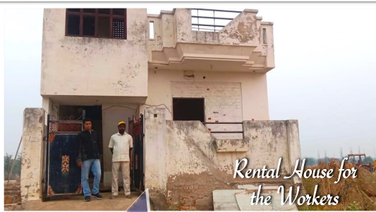
Rental House for the Workers

After accommodations were taken care of, the men were able to begin building! They started with a time of prayer dedication over the foundation. Afterwards, they were able to fashion the necessary structure to establish an electrical supply for the prayer house.