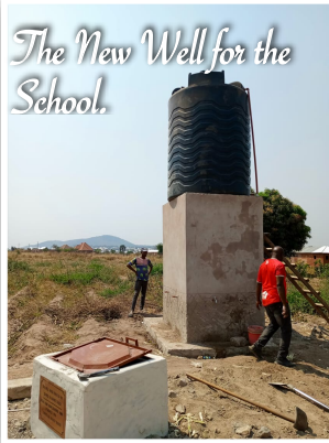
The New Well for the School.

We are so thankful for you, our partners, who have joined in with us to lay a deep and secure foundation from which the Gospel has been able to go forth and transform countless lives. May God richly bless you as we continue “Reaching Around the World with the Word.”