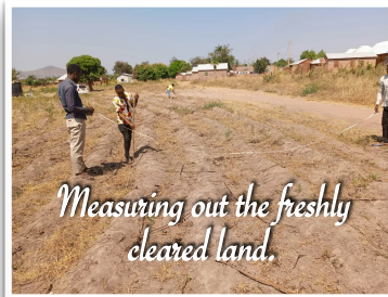
Measuring out the freshly cleared land.