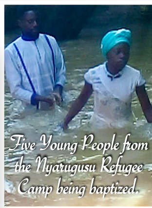
Five Young People from the Nyarugusu Refugee Camp being baptized.