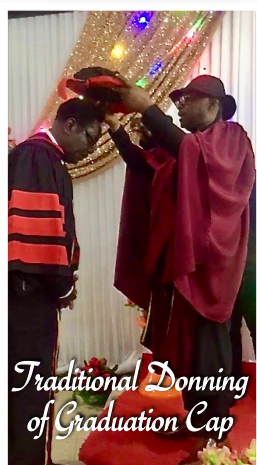
Traditional Donning of Graduation Cap