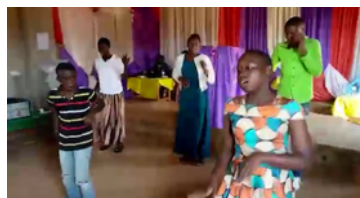
Mara Region at the border of Republic of Kenya