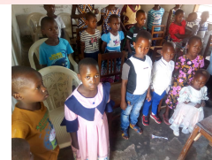
Children's Church in Mpanda.

New Harvest Ministries of Tanzania was able to host several conferences this year... Youth Conference in Dar Es Salaam in June ~ Women's Conference in Dar Es Salaam in August Annual Shiloh Conference in Mpanda in October ~ OVER 1,000 accepted Jesus as their Savior