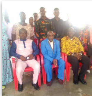
Seated are the pastors of the new Morogoro churches.