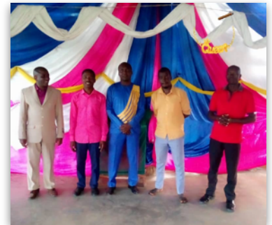
Turiani church leaders who will oversee the new Morogoro churches.

Maternity ward construction next to the medical dispensary is progressing. The walls are erected and timber for the roof has been delivered.