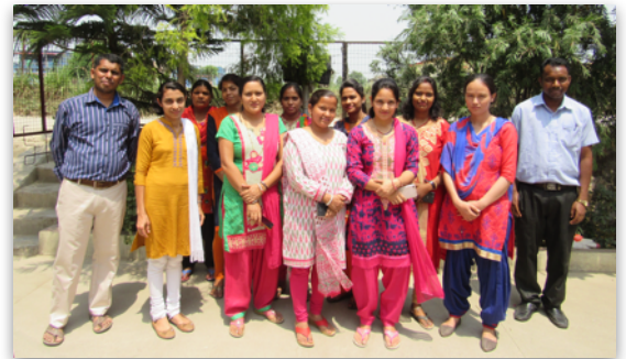
Elizabeth Day School staff.