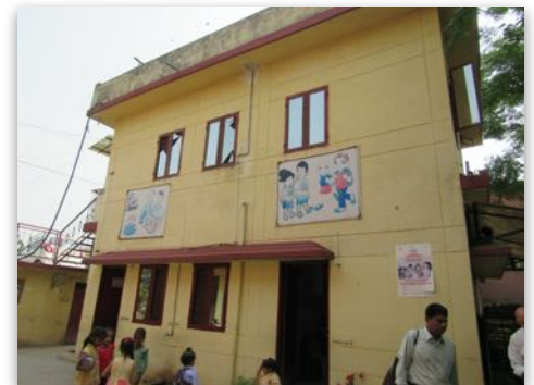
Elizabeth Day School