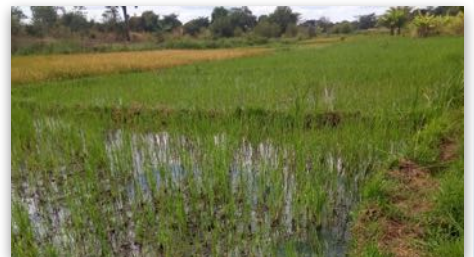
Newly added rice plantation.