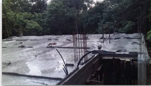
The cemented roof curing.