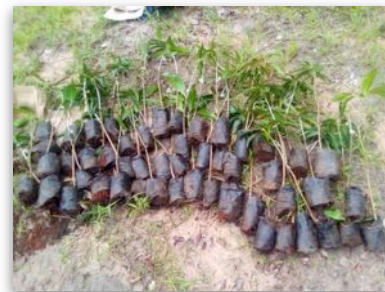
Above: Mango tree sprouts ready for planting.