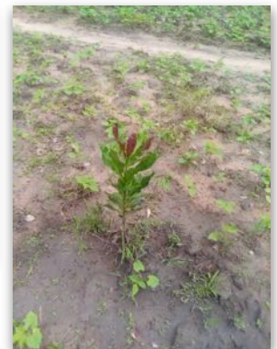
Above: Cashew trees with beans planted between them to prevent bushes from invading.