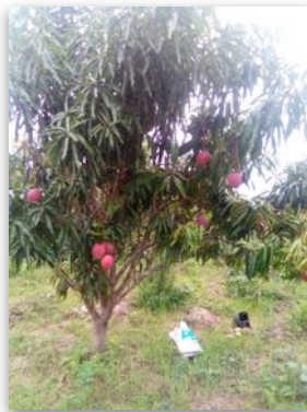
Above: Fully blooming mango tree.

Tanzania: The agricultural project is growing quickly with great income potential. The goal is to produce sufficient harvest to help support the pastors and the expanding work of the ministries-Funds are still needed to continue the current planting season and help clear more land for cultivation.