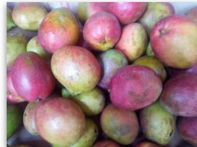
Right: Part of the latest mango crop.