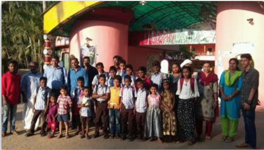
The orphans are doing well in school and are growing in their faith. They enjoyed their Christmas vacation from December 24-January 6.