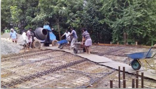
Pouring cement for the roof.

India: Faith In Action Ministries has completed the first phase of conference grounds construction with $15,700 that they raised through their local churches. They will need approximately $15,000 more to complete the second phase of construction. This would cover plastering, tiles, plumbing, electrical, grill works, and a separate kitchen.