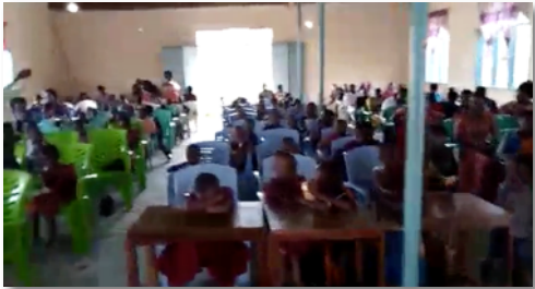
The children were the guests of honor on this day of celebration.

All of the New Harvest churches in Tanzania and surrounding nations celebrated children's day on the 3rd Sunday of January. The children are honored as the gifts from God that they are. What a beautiful celebration of God's young blessings.