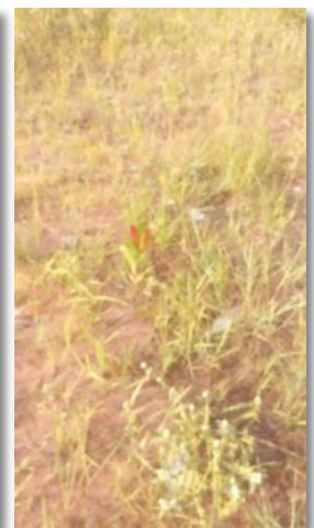
Cashew sprout and beans.