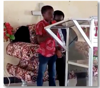
This young man delivered a powerful sermon.