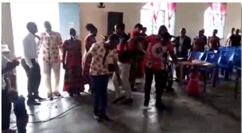
Songs of worship and dances of praise.

The agricultural project continues to expand, providing income for many New Harvest pastors.