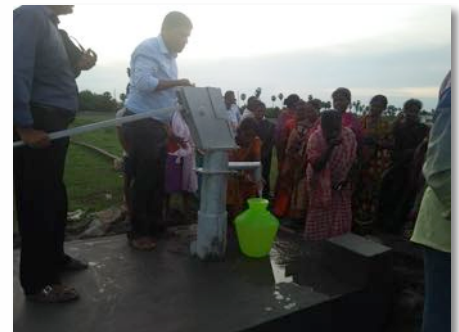
The well at Chennai.